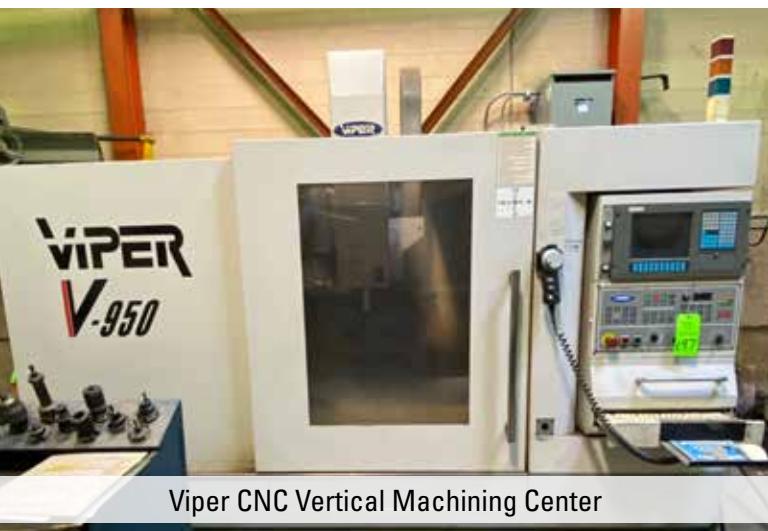
Viper CNC Vertical Machining Center