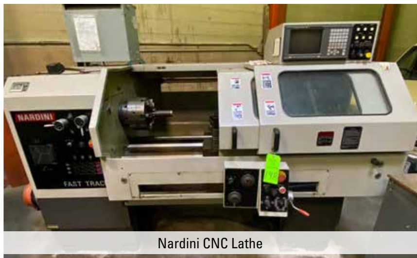
Nardini CNC Lathe