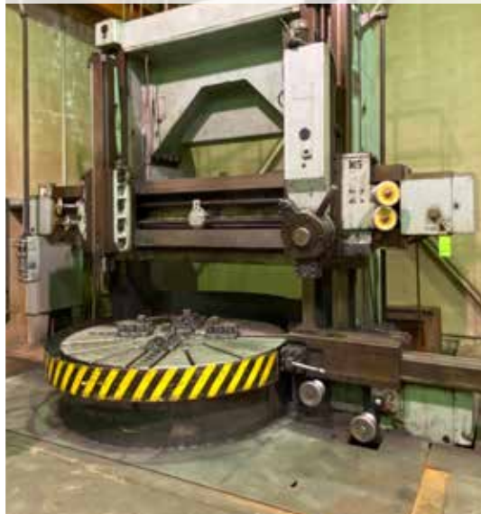
Stanko Vertical Double Column Boring and Turning Mill, 98" Table, 78" Vert

ONLINE BIDDING AT: WWW.BIDSPOTTER.COM LOTS OPEN: PRE-AUCTION OFFERS INVITED FOR MAJOR ASSETS