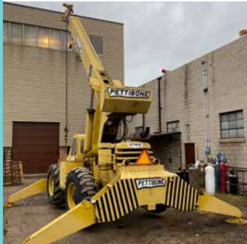
15 Ton Pettibone Rough Terrain Crane