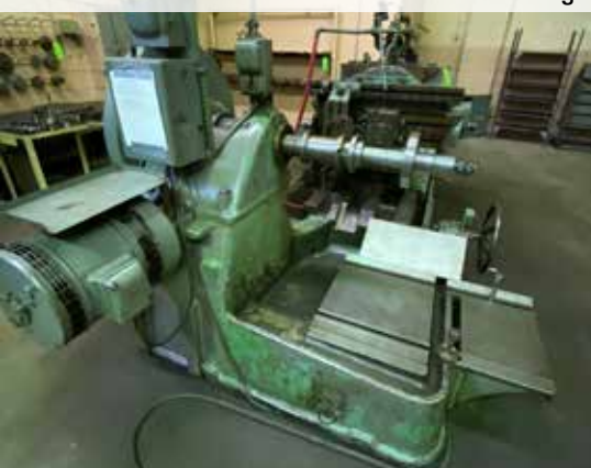
Sunderland No. 19 Gear Planer and Tooling