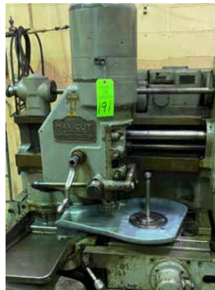
3-A Maxicut Gear Shaper