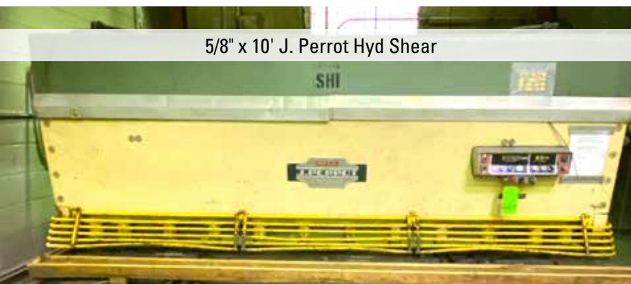
5/8" x 10' J. Perrot Hyd Shear