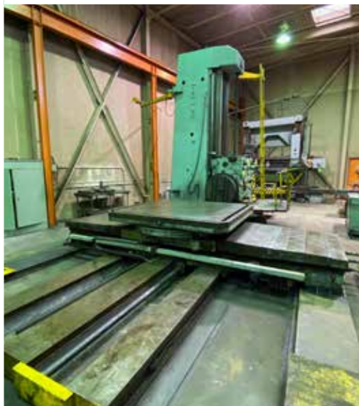
6" Collet & Engelhardt VFT-150 HBM with Rotary