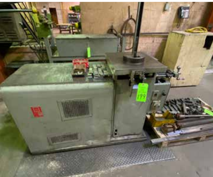
Mitts & Merrill Hyd Keyseater with Tooling