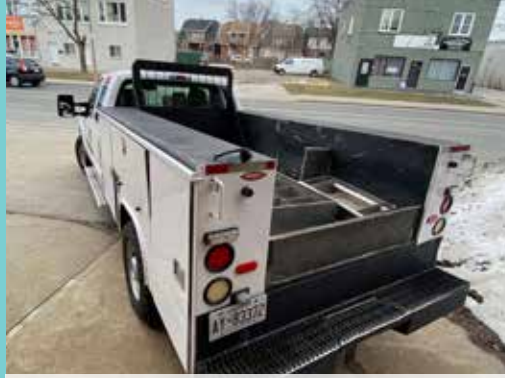
Ford F-350 Utility Truck (2011)