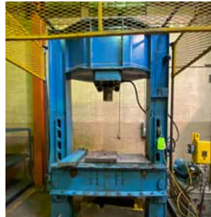
Large Heavy Duty Shop Press