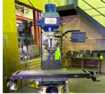
Darberts Vertical J Head Milling