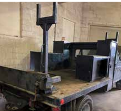
Ford Stake Utility Truck