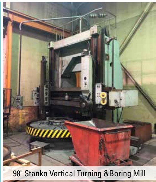
98" Stanko Vertical Turning & Boring Mill