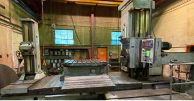
5' Stanko HBM with Rotary Table