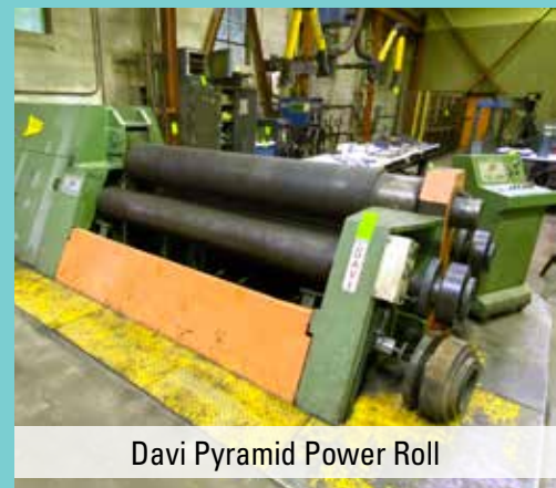
Davi Pyramid Power Roll