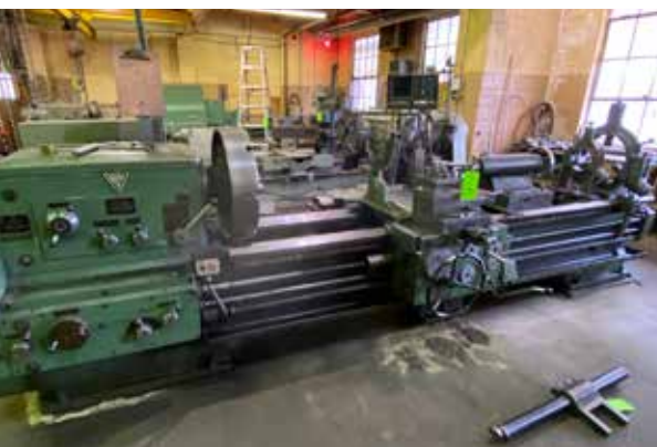
28" x 108" Stanko Model 1M63 Lathe