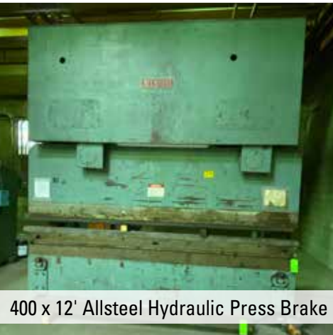
400 x 12' Allsteel Hydraulic Press Brake