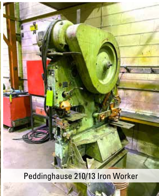
Peddinghouse 210/13 Iron Worker