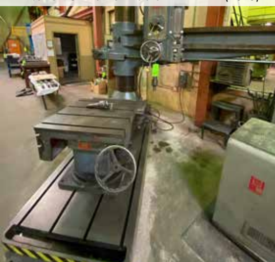
Kitchen & Walker Radial Arm Drill (1978)

ONLINE BIDDING AT: WWW.BIDSPOTTER.COM LOTS OPEN: PRE-AUCTION OFFERS INVITED FOR MAJOR ASSETS