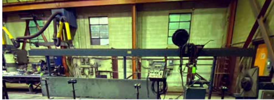
Aronson #HS2 30,000 lb Cap Traveling Head, Rotating Weld Station