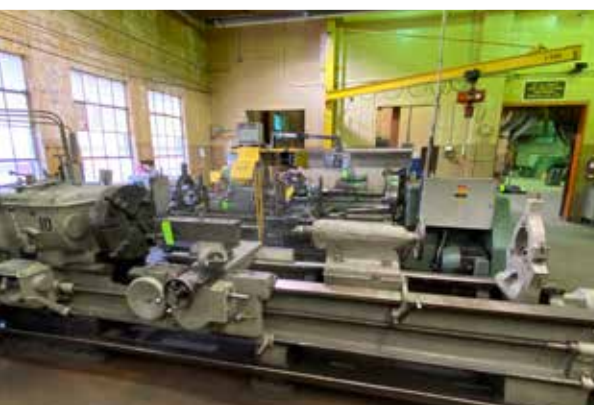
28" x 132" Bertram No 4 Lathe