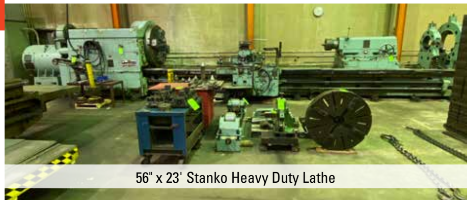
56" x 23' Stanko Heavy Duty Lathe