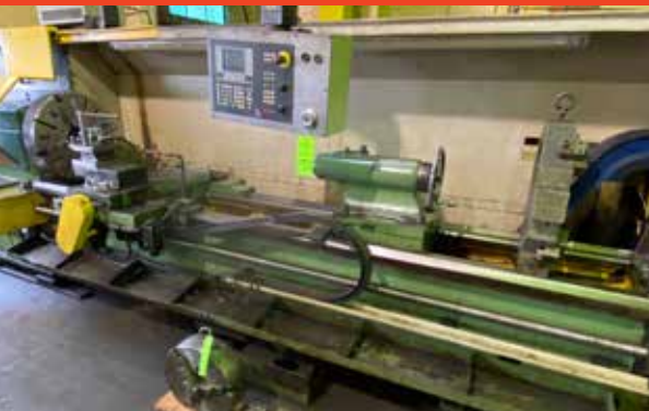
28" x 108" CNC Stanko Lathe