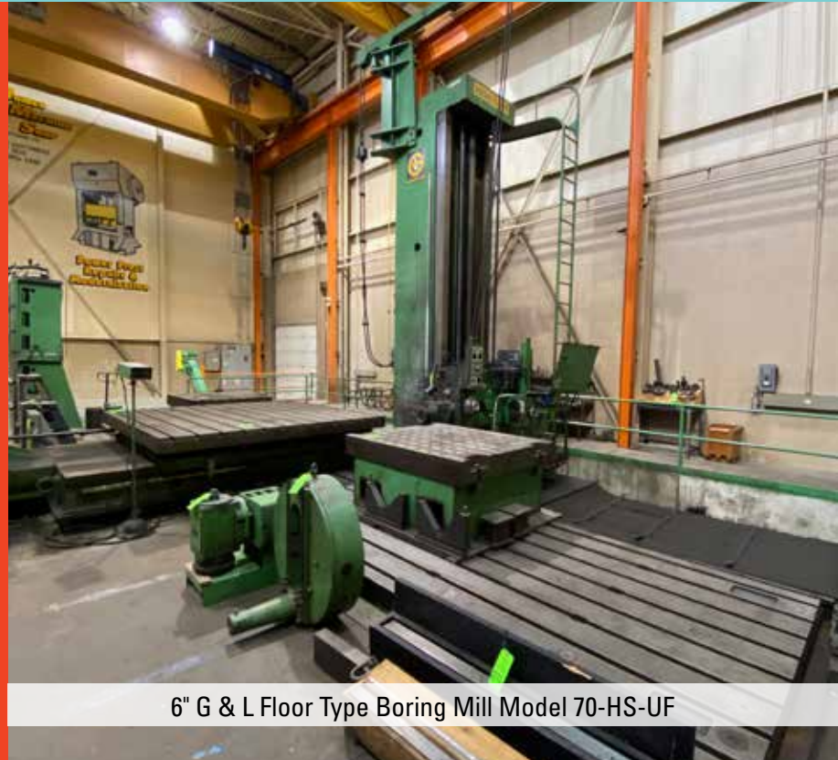
6" G & L Floor Type Boring Mill Model 70-HS-UF