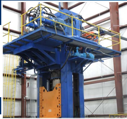
Hyd Press HPM

1200 ton HPM Hyd Downacting Press Model CU-2D, Complete Rebuild, Hyd., Mech and Electrical (2014). 48" STR, 90" D.L.O., 60"x60" B.A., Gibbed Guided, Little Use Since Rebuild.