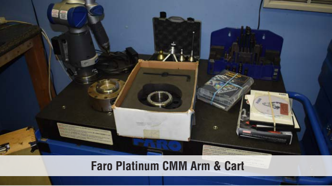
Faro Platinum CMM Arm & Cart