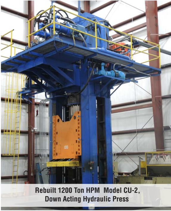
Rebuilt 1200 Ton HPM Model CU-2, Down Acting Hydraulic Press

INSPECTION DATES: M-F April 16-20, 8 am - 4 pm each day or by special appointment