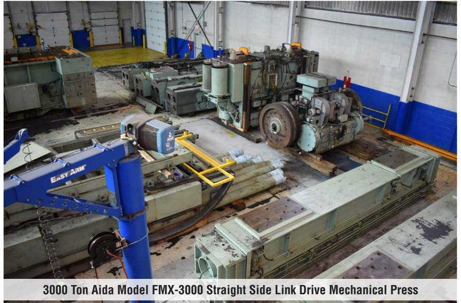
3000 Ton Aida Model FMX-3000 Straight Side Link Drive Mechanical Press

Hydraulic & mechanical presses up to 3000 tons, AJAX TOCCO billet oven metrology, cooling tower, rolling stock, hand tools, new bar stock up to 5" diam x 20' long. Shelving, full shop support items, office furniture, scissor lifts, full cabinets of new nuts, bolts, seals, many tons of forge dies, saws, small drills, metal bins