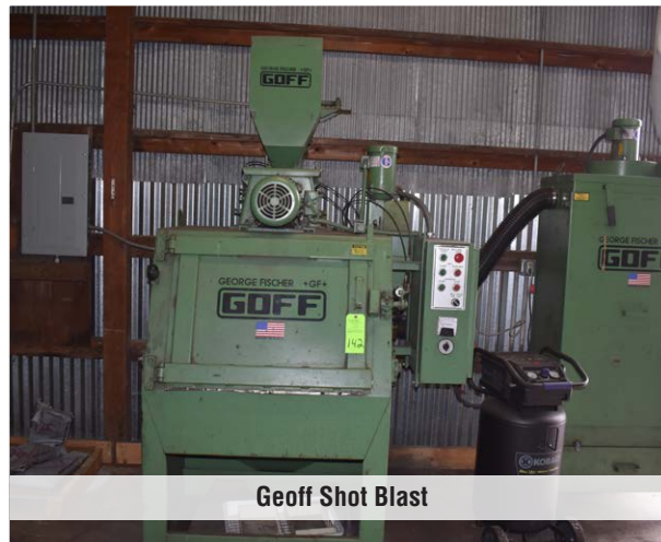
Geoff Shot Blast