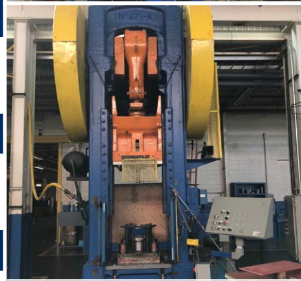
200 Ton Bliss

1200 ton HPM Hyd Downacting Press Model CU-2D, Complete Rebuild, Hyd., Mech and Electrical (2014). 48" STR, 90" D.L.O., 60"x60" B.A., Gibbed Guided, Little Use Since Rebuild.