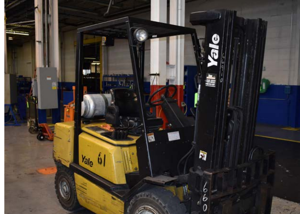
5000 LB Yale LP Fork Truck. 3-Stage Mast 187" Side Shift Fork Adjustment (2005)