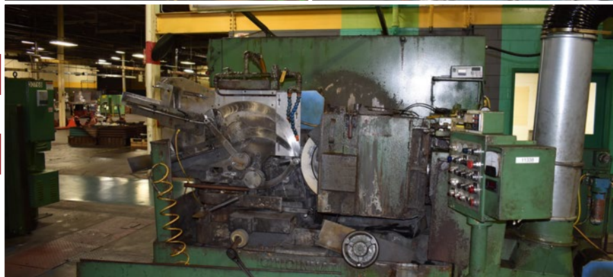
Cincinnati Millicron no. 1, "N" Base chucking grinders model DE