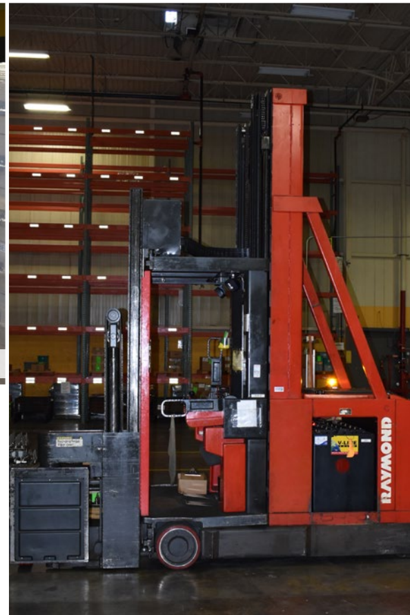
Raymond electric 3000 lbs, stand up fork truck