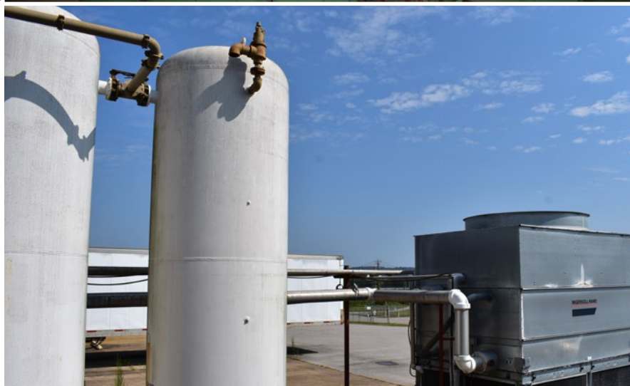
Full plant support equipment through out plant