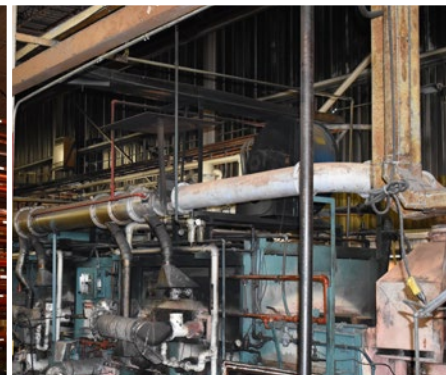
Large assortment of Heat treat department