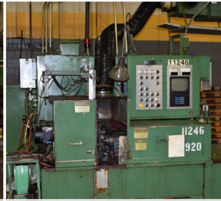
Heald OCF-90 & 91