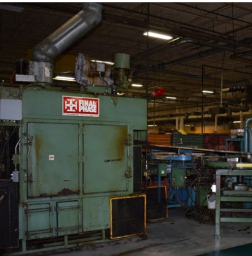
Final phase heated rinse tank for post Grind cell