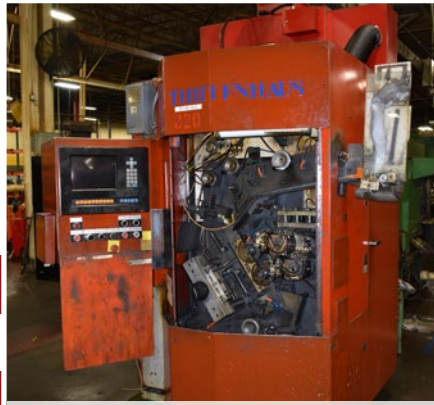
Thielenhaus Hones. O.D & I.D