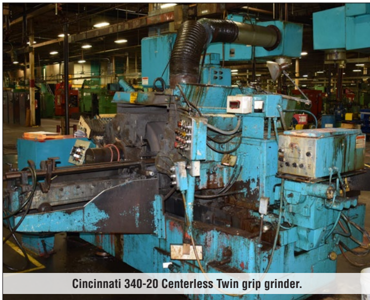
Cincinnati 340-20 Centerless Twin grip grinder.

INSPECTION LOCATION: 727 Kathleen Dr. | Pulaski, TN 38478