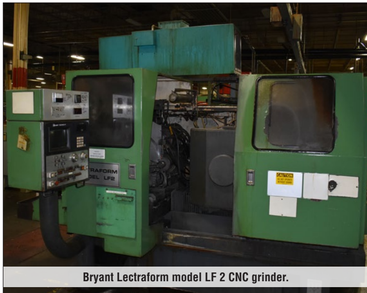
Bryant Lectraform model LF 2 CNC grinder.