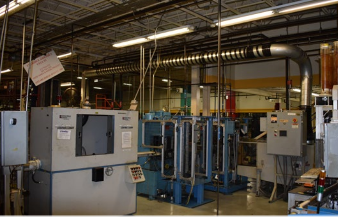
Fully automated laser bearing marking assembly cell