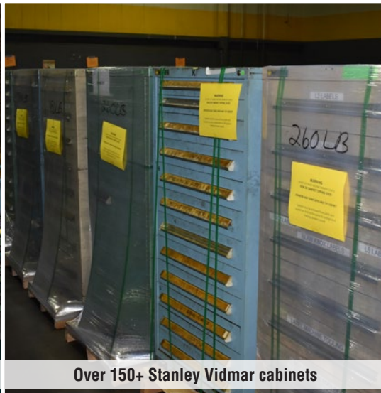
Over 150+ Stanley Vidmar cabinets