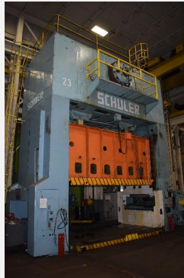
1100 Ton Schuler Press